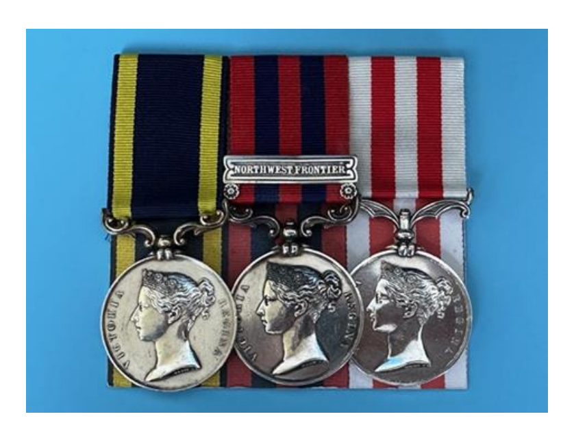
Victorian medals from a single owner collection (29th March)

This is followed on Thursday 29<sup>th</sup> March with coins, medals, stamps & toys including a single owner collection of 220 medal groups.