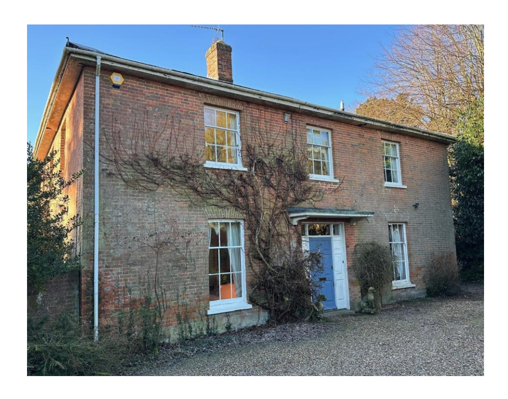
The residual contents from a Hampshire old vicarage (1st March)

All the lots, with live internet bidding, will be available on www.charterhouse-auction.com