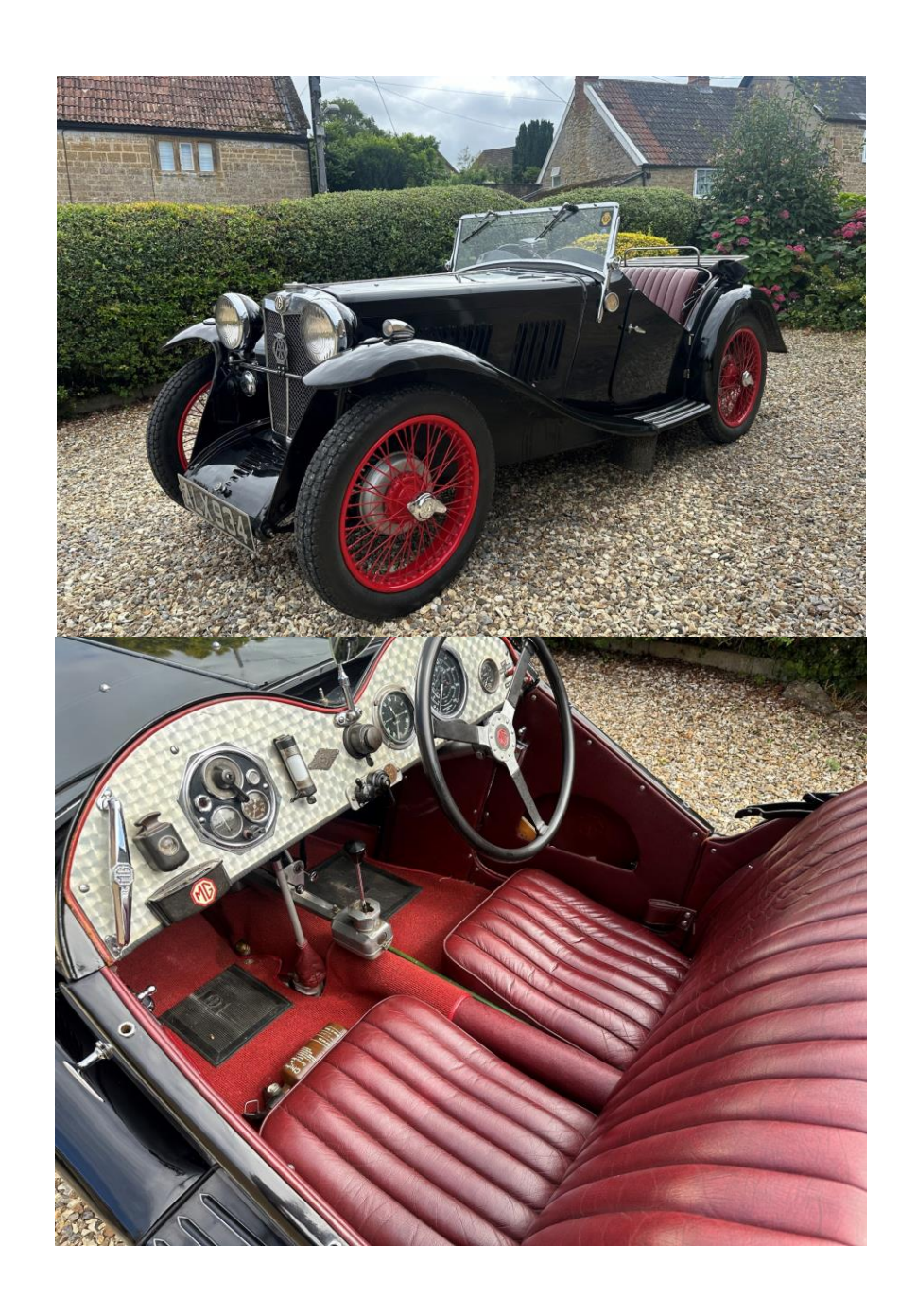
1933 MG J2 in the Charterhouse classic car auction on 24th October

The MG was enjoyed by the owner's father who had trips across Europe including driving around pre-war Germany. The car was subsequently sold and needing restoration was stored in a barn until the son tracked the car down nearly 20 years ago.