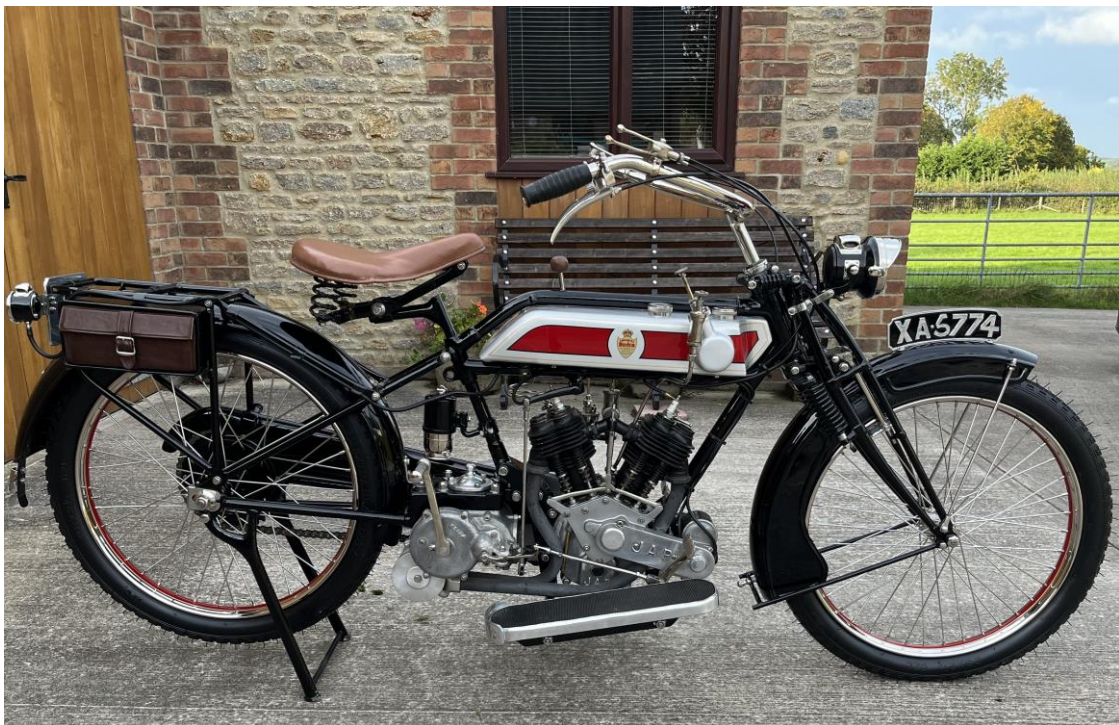
1921 Rover Imperial

Finally a 1921 Rover Imperial at £20,000-£22,000. All the bikes are in mint condition and ready to ride.