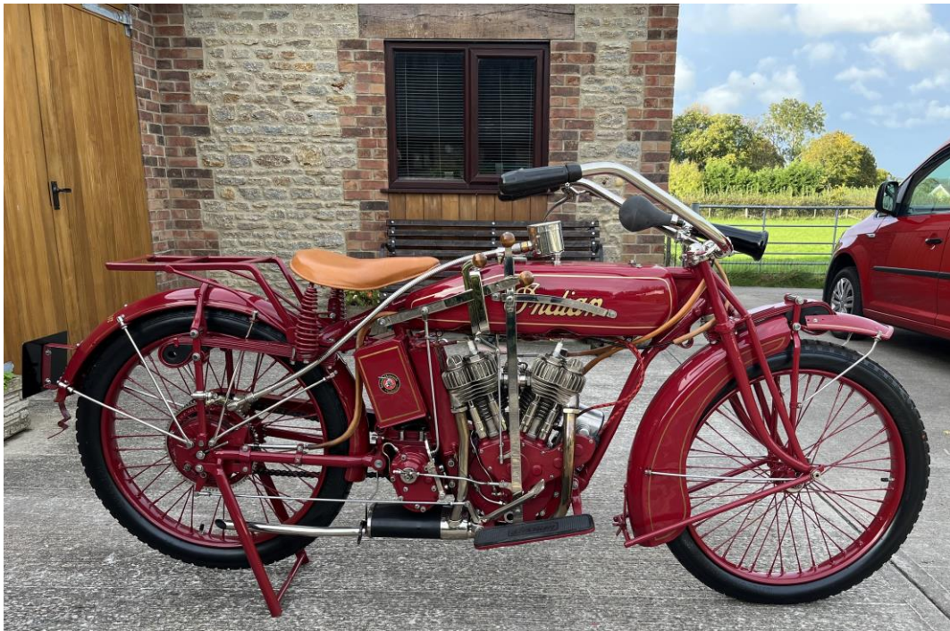
1918 Indian Powerplus

The eldest motorcycle is a 1918 Indian Powerplus at £30,000-£35,000.